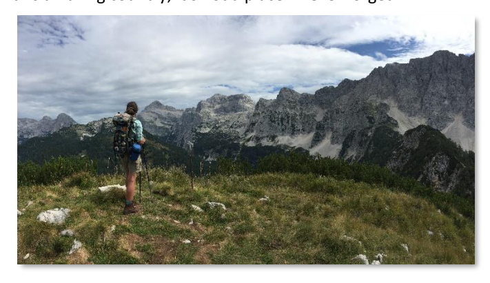
I led a CMC Adventure Travel trip to Slovenia in August 2017. I have trekked and climbed numerous places around the world

Why Slovenia? What is Slovenia? Where is Slovenia? Many of you may never have heard of it or may have confused it with another European country. My stepfather thought it was the country that had been invaded by Russia. Even those that know the country's location may still not know why they should be interested in going there. But after spending time in this amazing country, it's not a place I'll ever forget.