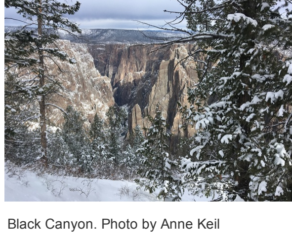
Black Canyon.

See below on how to submit your favorite photo for the newsletter!